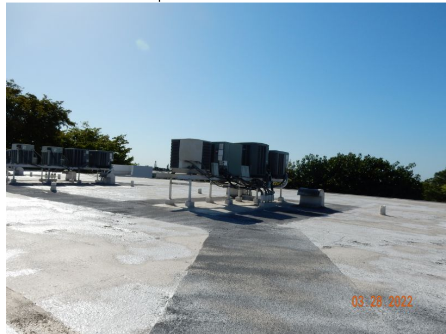
Silicone Over Built-up