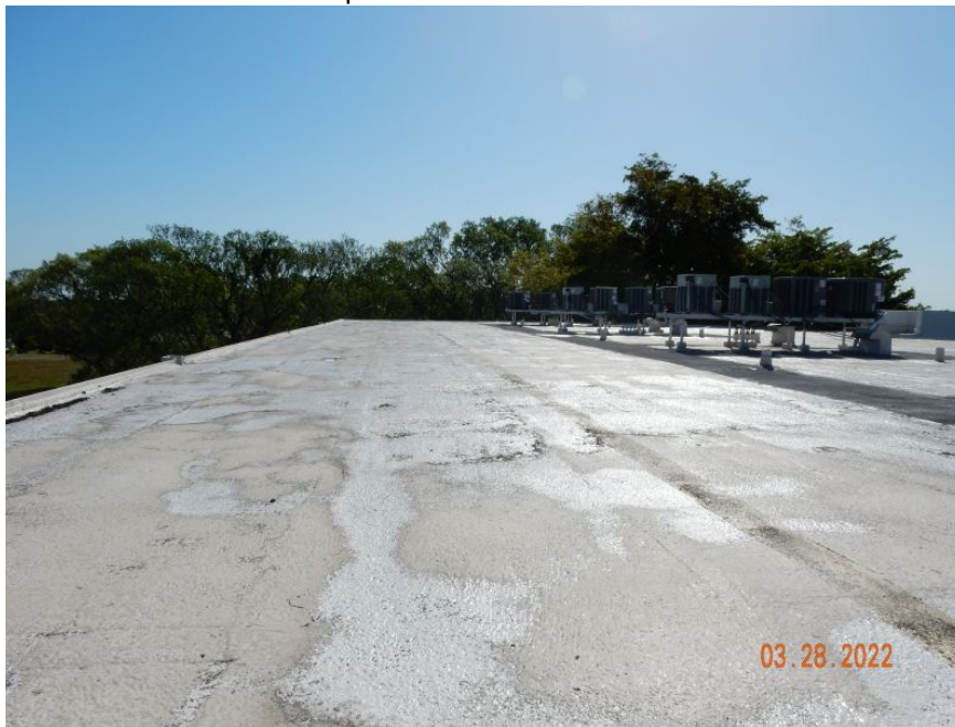
Silicone Over Built-up